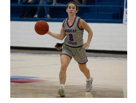
The Lady Aggies also picked up a big win this week as they defeated NEO, 77-64, on Thursday night.

Murray State College | One Murray Campus, Tishomingo, OK 73460