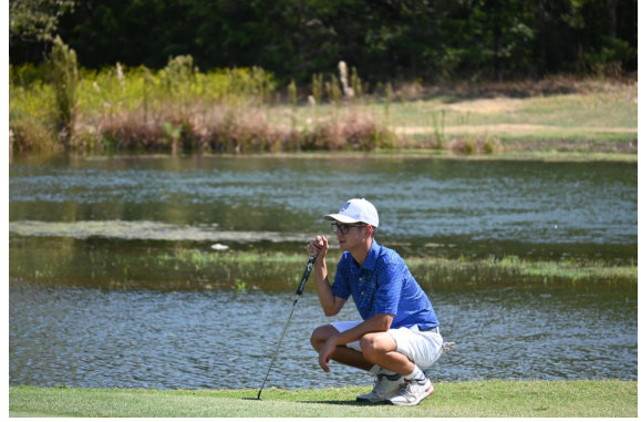
The men's team earned fourth place.