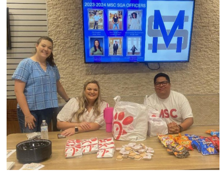
The BCM provided lunch on Wednesday.