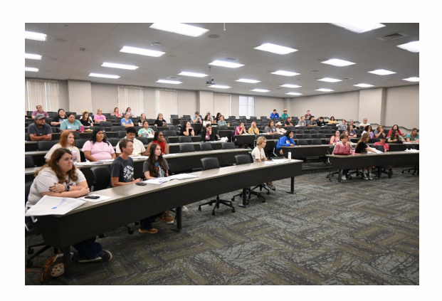
Next week's Aggie Days are August 1st and 2nd.

They learned how to log in to their Aggies Online portal and toured around campus.