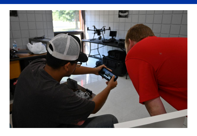
Murray State College held drone seminars at Idabel Public School and Murray State's Ardmore